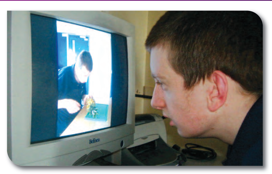
Choosing photographs for a review