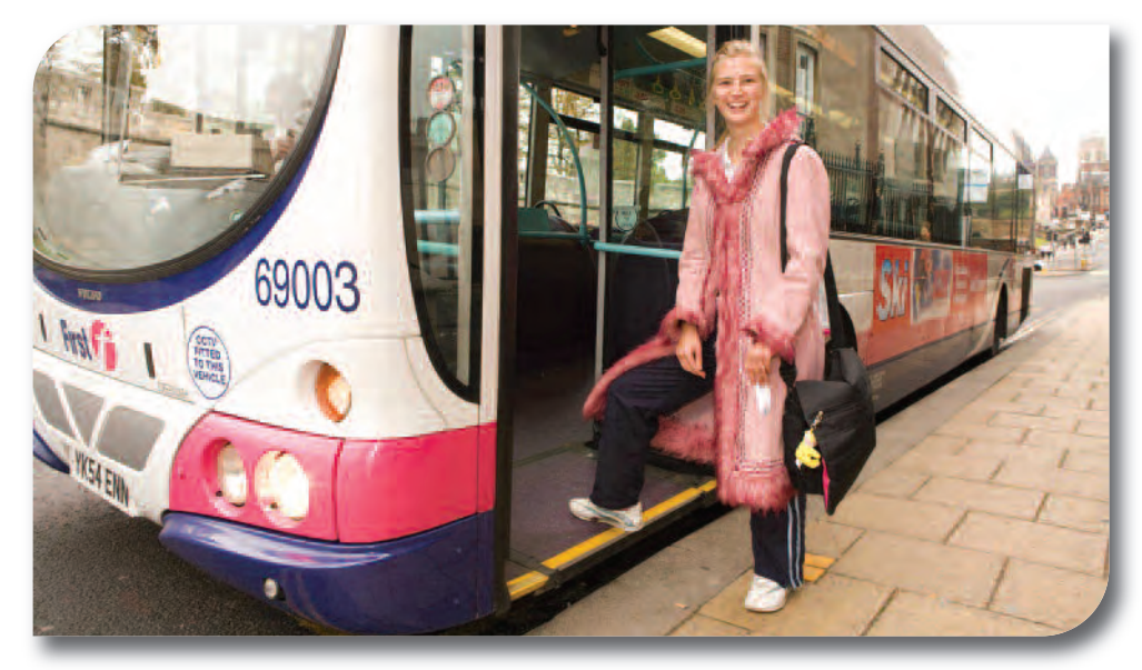
Learning to travel independently