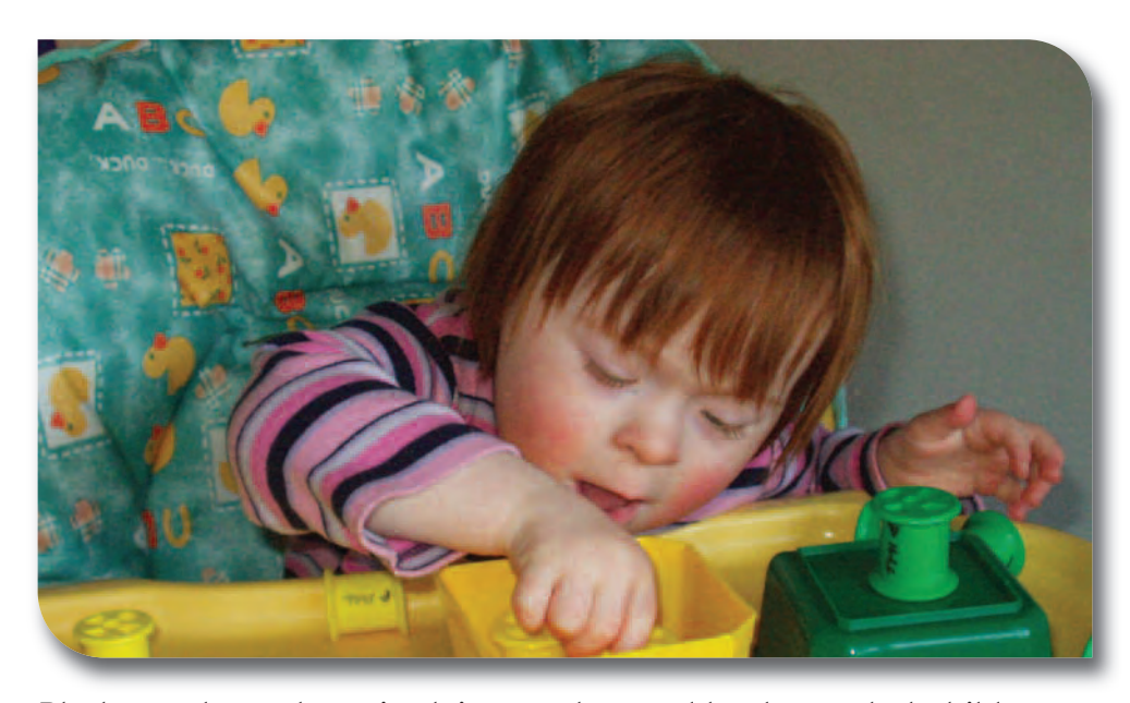
Photographs and comic strips can be used to share what children like to do with others